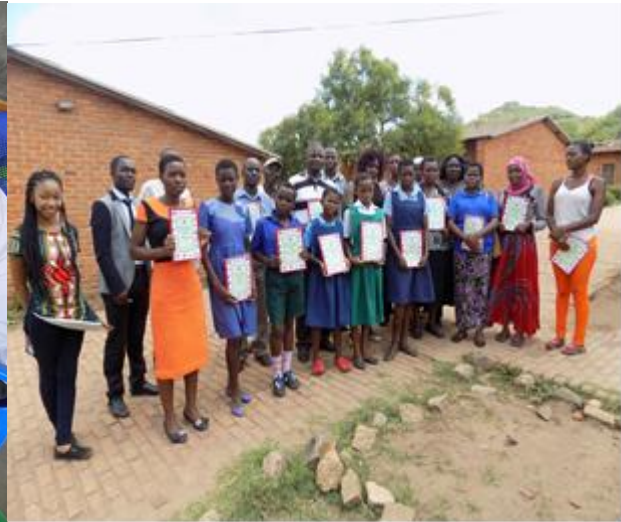
Group photo after the training