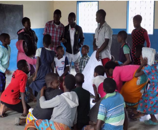
Monitoring session in Chiradzulo district