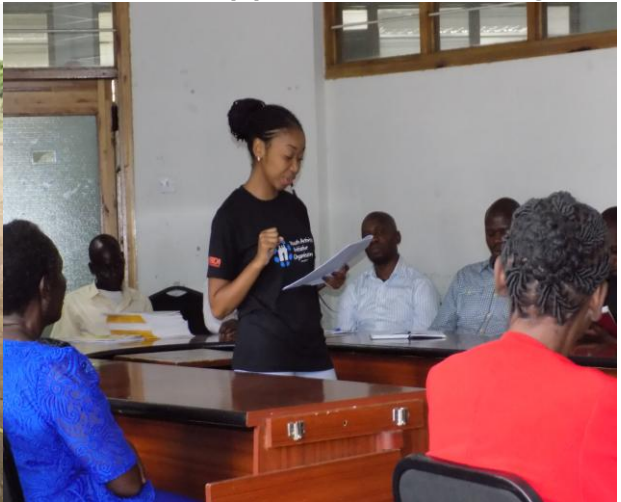
Quarterly review meeting in progress