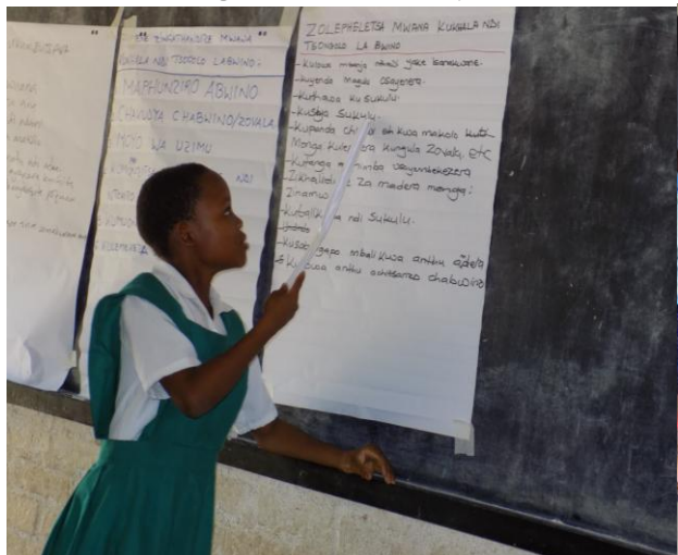
Monitoring session at Namatete Primary School