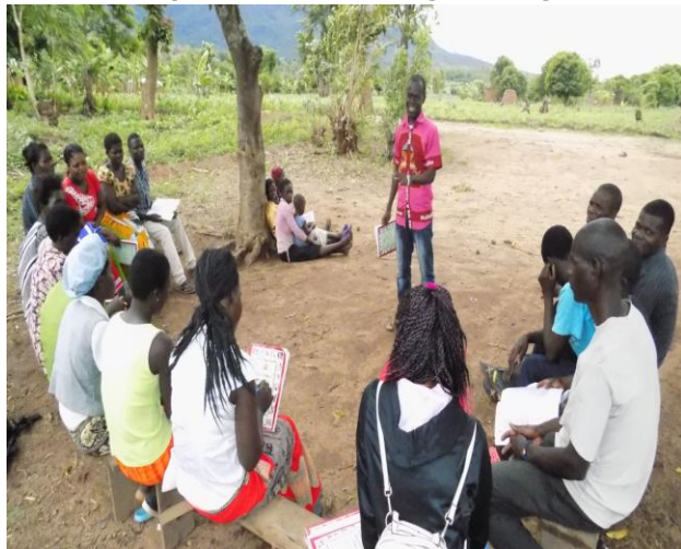
Monitoring session in Mulanje district