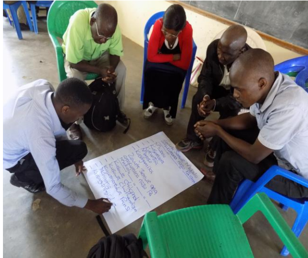
Group discussions during training session