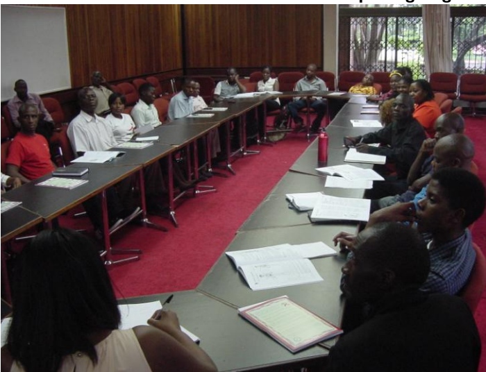
A cross-section of participants