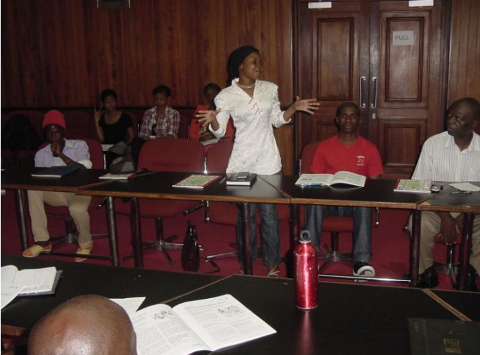
Participants giving their comments on the book